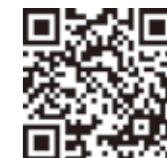
大會活動報名專區